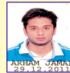
ARHAM AIEEE-AIR-86975 STATE-7169 SRM-AIR-35529 C.B.S.E-XII PHY-68, CHEM-56 MATHS-44